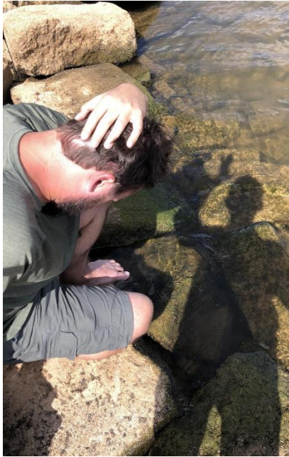
Note: he was completely unaware of this photo being taken.